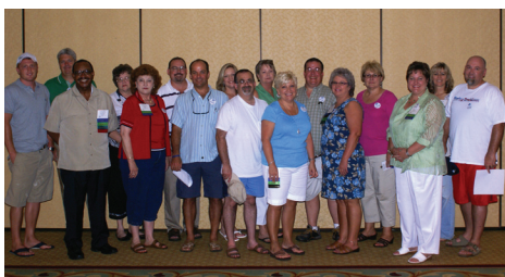
ACHCA members attend the GHCA convention in Amelia Island, FL

I have found that the great thing in this world is not where we stand, but in what direction we're moving. Oliver Wendell Holmes